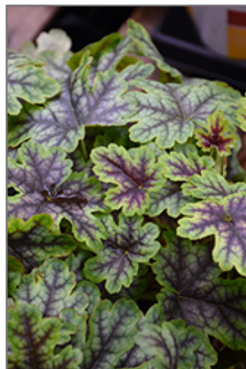
Tapestry Foamy Bells foliage

Tapestry Foamy Bells is recommended for the following landscape applications;