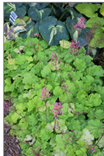
Primo Pretty Pistachio Coral Bells in bloom

This is a relatively low maintenance plant, and should be cut back in late fall in preparation for winter. It is a good choice for attracting butterflies and hummingbirds to your yard. It has no significant negative characteristics.