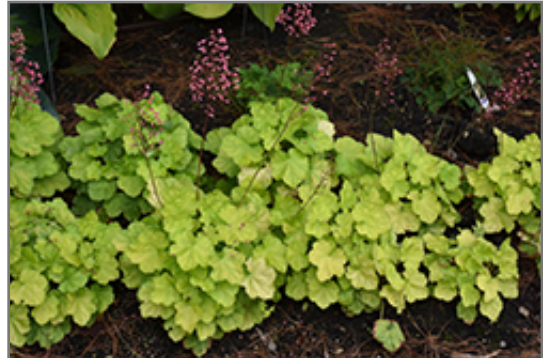
Primo Pretty Pistachio Coral Bells

* This is a 'special order' plant - contact store for details