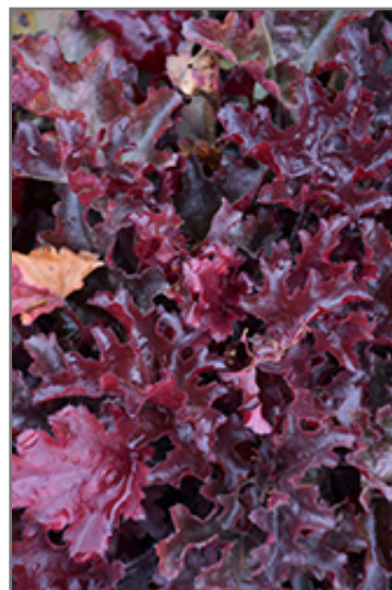
Dolce Cherry Truffles Coral Bells foliage