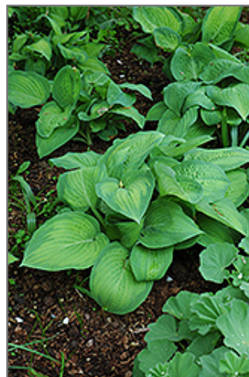
Paul's Glory Hosta