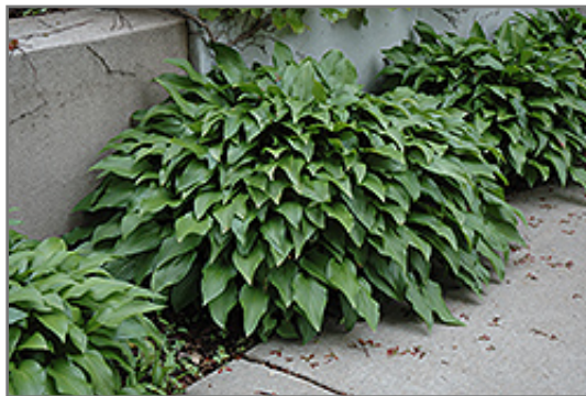
Invincible Hosta