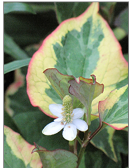
Chameleon Houttuynia flowers