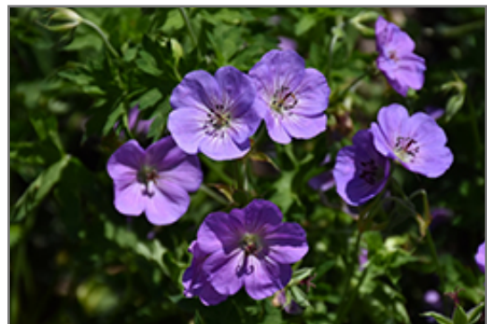
Azure Rush Cranesbill flowers