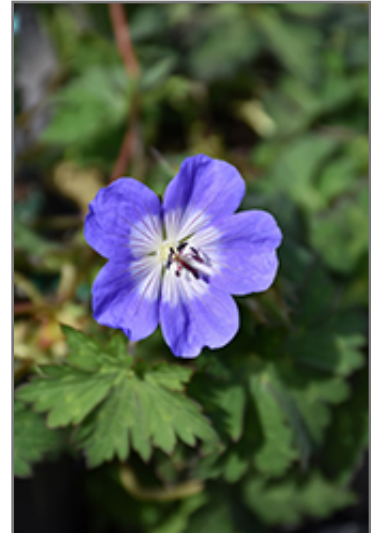
Azure Rush Cranesbill flowers

This is a relatively low maintenance plant, and should only be pruned after flowering to avoid removing any of the current season's flowers. Deer don't particularly care for this plant and will usually leave it alone in favor of tastier treats. It has no significant negative characteristics.