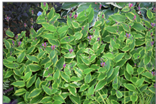
Autumn Glow Toad Lily in bloom