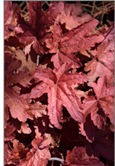
Fun and Games Red Rover Foamy Bells foliage

Fun and Games Red Rover Foamy Bells is a dense herbaceous evergreen perennial with tall flower stalks held atop a low mound of foliage. Its relatively fine texture sets it apart from other garden plants with less refined foliage.