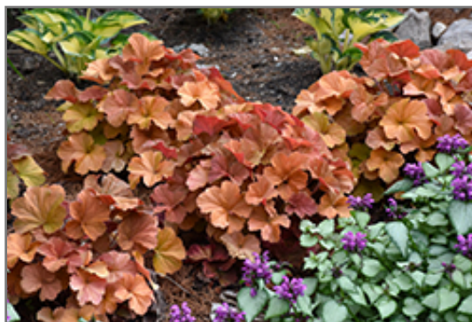
Northern Exposure Amber Coral Bells