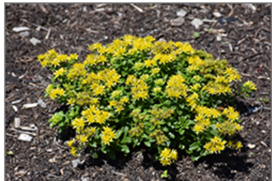
Little Miss Sunshine Stonecrop in bloom