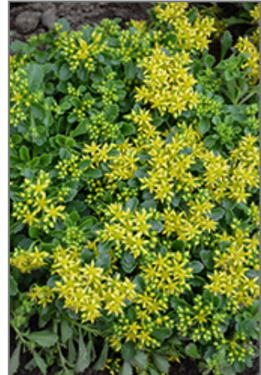
Little Miss Sunshine Stonecrop flowers

Little Miss Sunshine Stonecrop is recommended for the following landscape applications;