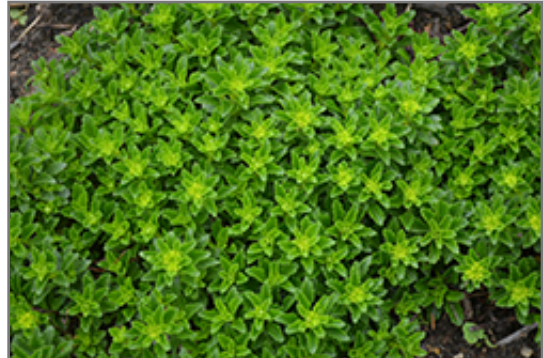
Little Miss Sunshine Stonecrop

Little Miss Sunshine Stonecrop will grow to be only 6 inches tall at maturity, with a spread of 18 inches. When grown in masses or used as a bedding plant, individual plants should be spaced approximately 14 inches apart. It grows at a fast rate, and under ideal conditions can be expected to live for approximately 15 years.