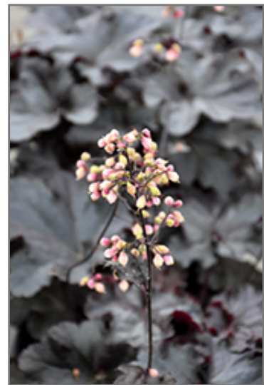
Black Pearl Coral Bells flowers