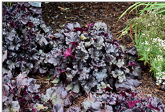
Black Pearl Coral Bells

Black Pearl Coral Bells is a fine choice for the garden, but it is also a good selection for planting in outdoor pots and containers. With its upright habit of growth, it is best suited for use as a 'thriller' in the 'spiller-thriller-filler' container combination; plant it near the center of the pot, surrounded by smaller plants and those that spill over the edges. Note that when growing plants in outdoor containers and baskets, they may require more frequent waterings than they would in the yard or garden.