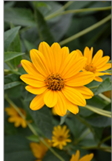
False Sunflower flowers

This is a relatively low maintenance plant, and is best cleaned up in early spring before it resumes active growth for the season. It is a good choice for attracting butterflies to your yard. It has no significant negative characteristics.