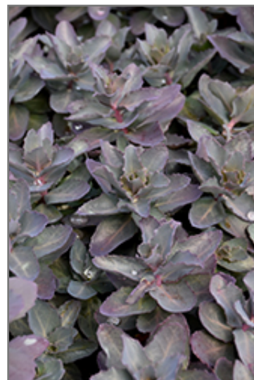
Cherry Truffle Stonecrop foliage

* This is a 'special order' plant - contact store for details