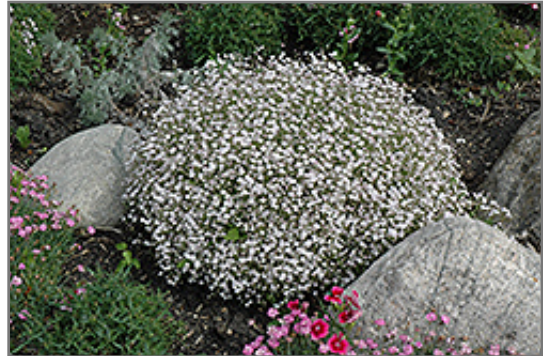
Creeping Baby's Breath in bloom

Creeping Baby's Breath is recommended for the following landscape applications;