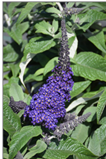
Pugster Blue Butterfly Bush flowers

Pugster Blue Butterfly Bush is recommended for the following landscape applications;