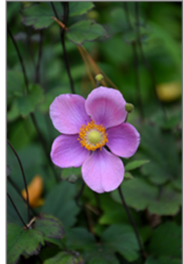
Lucky Charm Anemone flowers