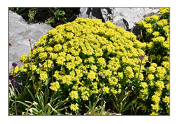
Cushion Spurge in bloom

This is a relatively low maintenance plant, and should only be pruned after flowering to avoid removing any of the current season's flowers. Deer don't particularly care for this plant and will usually leave it alone in favor of tastier treats. Gardeners should be aware of the following characteristic(s) that may warrant special consideration;