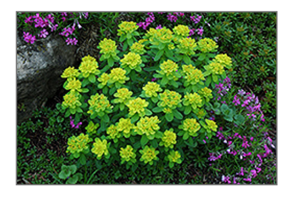
Cushion Spurge in bloom

Cushion Spurge is an herbaceous perennial with a mounded form. Its medium texture blends into the garden, but can always be balanced by a couple of finer or coarser plants for an effective composition.