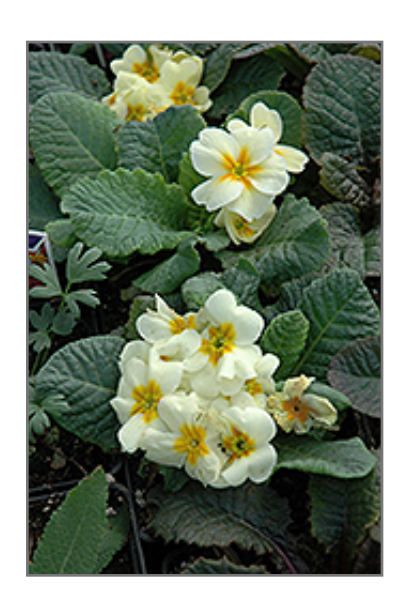
Wanda Primrose flowers

Wanda supreme mixture features fantastic clusters of blooms in wine red, yellow, blue, pink bicolor, purple, rose, pink and white; all above deep green foliage for wonderful contrast; a colorful display in an indoor container or basket