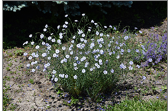
Blue Sapphire Perennial Flax in bloom

Blue Sapphire Perennial Flax is recommended for the following landscape applications;