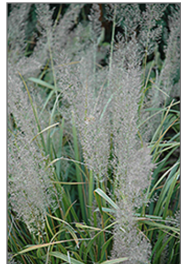
Korean Reed Grass fruit