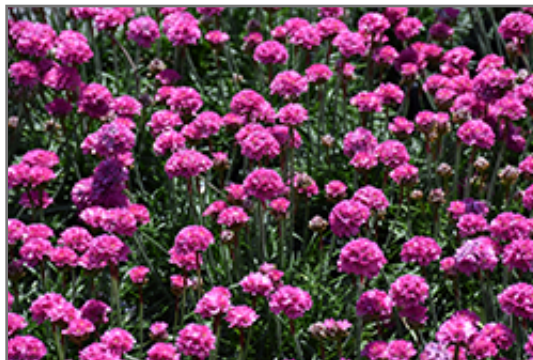
Dusseldorf Pride Sea Thrift flowers

Dusseldorf Pride Sea Thrift will grow to be only 6 inches tall at maturity extending to 8 inches tall with the flowers, with a spread of 8 inches. Its foliage tends to remain low and dense right to the ground. It grows at a slow rate, and under ideal conditions can be expected to live for approximately 10 years. As an evergreen perennial, this plant will typically keep its form and foliage year-round.