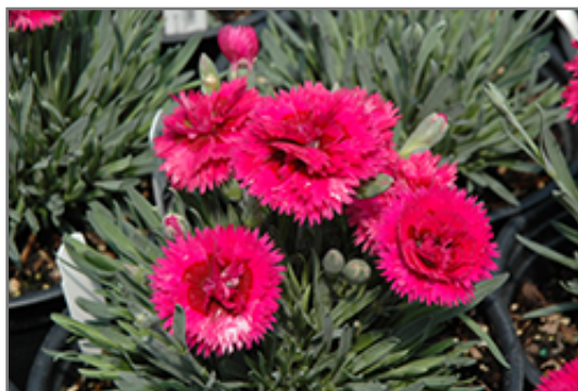
Starlette Pinks flowers