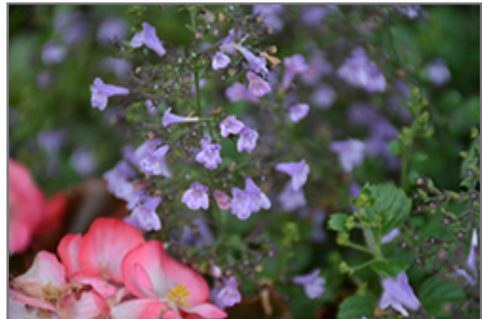
Marvelette Blue Dwarf Calamint flowers