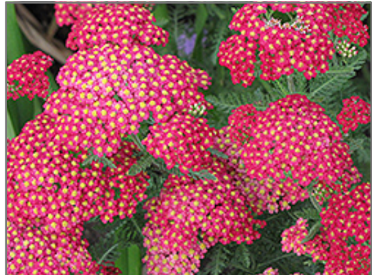
Galaxy Paprika Yarrow flowers