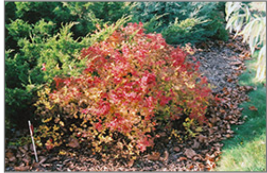
Golden Princess Spirea in fall