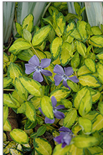
Illumination Periwinkle flowers

Illumination Periwinkle is recommended for the following landscape applications;