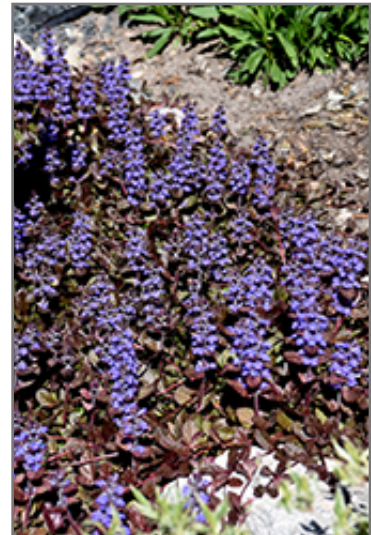
Mahogany Bugleweed flowers

Mahogany Bugleweed is a dense herbaceous evergreen perennial with a ground-hugging habit of growth. Its relatively fine texture sets it apart from other garden plants with less refined foliage.