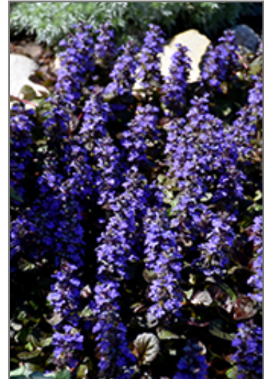
Mahogany Bugleweed flowers

* This is a 'special order' plant - contact store for details