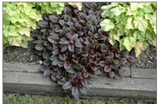
Mahogany Bugleweed