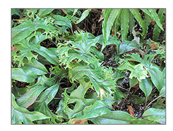
Crested Tongue Fern

A rare, attractive evergreen fern with thick leaves that are irregularly forked at the end, and have tan undersides; an excellent selection for rock gardens or containers; drought tolerant and takes summer heat well