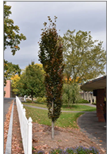
Dawyck Purple Beech

Dawyck Purple Beech is recommended for the following landscape applications;