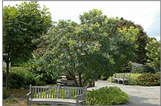
American Smoketree in bloom

This is a relatively low maintenance tree, and is best pruned in late winter once the threat of extreme cold has passed. Deer don't particularly care for this plant and will usually leave it alone in favor of tastier treats. It has no significant negative characteristics.