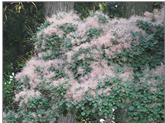
American Smoketree in bloom