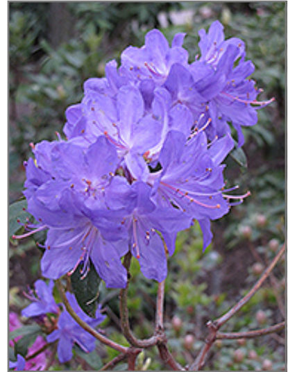
Blue Baron Rhododendron flowers