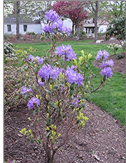
Blue Baron Rhododendron in bloom

* This is a 'special order' plant - contact store for details