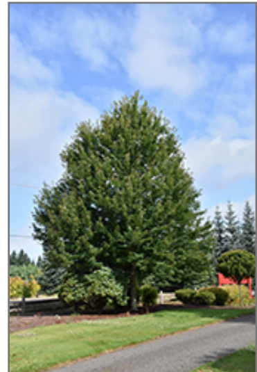
Redpointe Red Maple