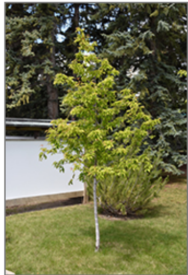
Amur Maple (tree form)