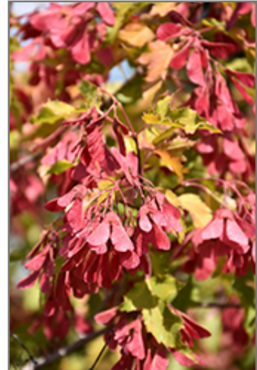
Amur Maple (tree form) fruit

This tree does best in full sun to partial shade. It is very adaptable to both dry and moist locations, and should do just fine under average home landscape conditions. It is not particular as to soil type or pH. It is highly tolerant of urban pollution and will even thrive in inner city environments. This is a selected variety of a species not originally from North America.