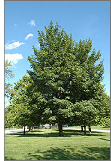
Norwegian Sunset Maple

This tree should only be grown in full sunlight. It is very adaptable to both dry and moist locations, and should do just fine under average home landscape conditions. It is not particular as to soil type or pH. It is highly tolerant of urban pollution and will even thrive in inner city environments. This particular variety is an interspecific hybrid.