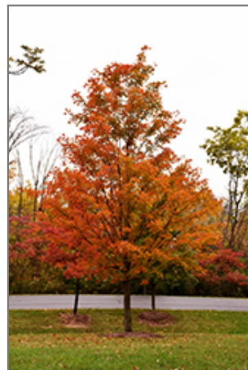
Norwegian Sunset Maple in fall