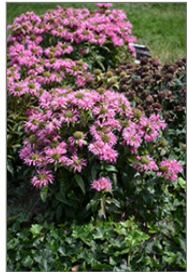
Pardon My Pink Beebalm in bloom