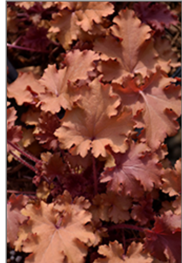
Peach Crisp Coral Bells foliage

* This is a 'special order' plant - contact store for details