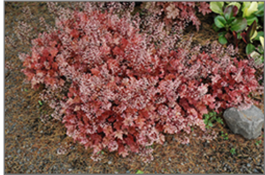
Peach Crisp Coral Bells in bloom

This is a relatively low maintenance plant, and should be cut back in late fall in preparation for winter. It is a good choice for attracting hummingbirds to your yard. It has no significant negative characteristics.