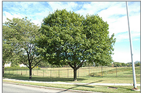
Norway Maple