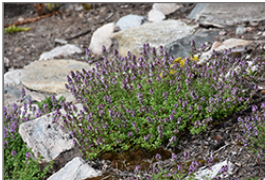
Lemon Thyme in bloom

This plant is quite ornamental as well as edible, and is as much at home in a landscape or flower garden as it is in a designated herb garden. It should only be grown in full sunlight. It prefers to grow in average to dry locations, and dislikes excessive moisture. It is considered to be drought-tolerant, and thus makes an ideal choice for a low-water garden or xeriscape application. It is not particular as to soil type or pH. It is highly tolerant of urban pollution and will even thrive in inner city environments. Consider covering it with a thick layer of mulch in winter to protect it in exposed locations or colder microclimates. This particular variety is an interspecific hybrid. It can be propagated by division; however, as a cultivated variety, be aware that it may be subject to certain restrictions or prohibitions on propagation.