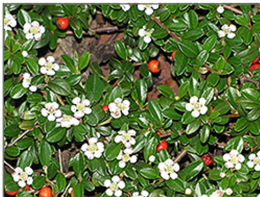
Coral Beauty Cotoneaster fruit