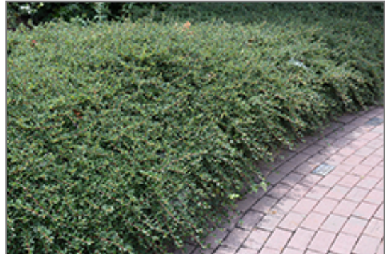
Coral Beauty Cotoneaster

Coral Beauty Cotoneaster is a multi-stemmed evergreen shrub with a shapely form and gracefully arching branches. It lends an extremely fine and delicate texture to the landscape composition which should be used to full effect.