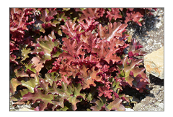
Dolce Cinnamon Curls Coral Bells foliage

Dolce Cinnamon Curls Coral Bells is recommended for the following landscape applications;