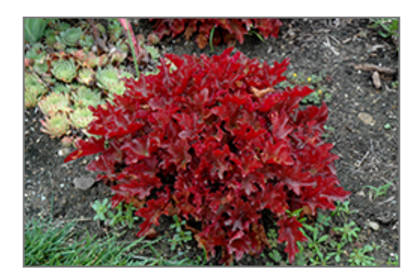
Dolce Cinnamon Curls Coral Bells