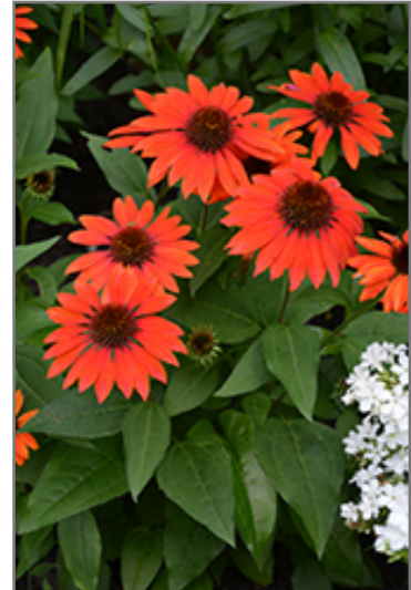
Sombrero Flamenco Orange Coneflower in bloom

Sombrero Flamenco Orange Coneflower is recommended for the following landscape applications;