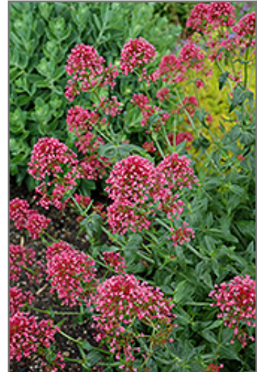
Red Valerian flowers

Red Valerian is recommended for the following landscape applications;