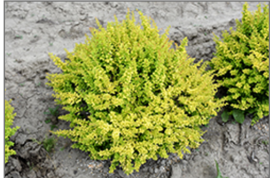
Sunsation Japanese Barberry

Sunsation Japanese Barberry is recommended for the following landscape applications;