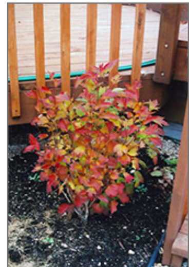
Compact Highbush Cranberry in fall