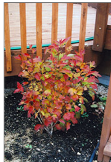
Compact Highbush Cranberry in fall