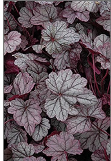
Carnival Sugar Plum Coral Bells foliage

This is a relatively low maintenance plant, and should be cut back in late fall in preparation for winter. It is a good choice for attracting hummingbirds to your yard. It has no significant negative characteristics.