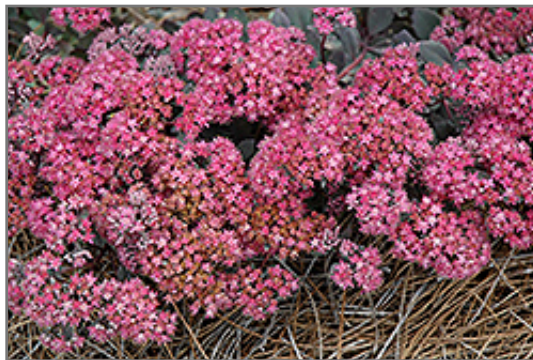
Dazzleberry Stonecrop flowers

Dazzleberry Stonecrop is a dense herbaceous perennial with an upright spreading habit of growth. Its medium texture blends into the garden, but can always be balanced by a couple of finer or coarser plants for an effective composition.