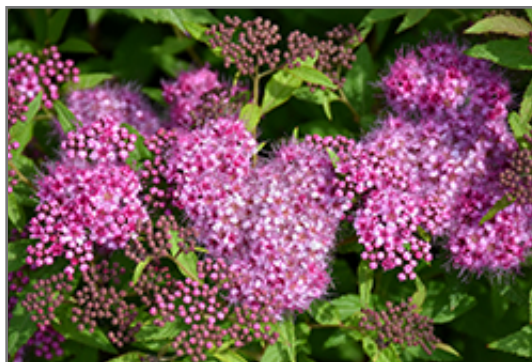
Anthony Waterer Spirea flowers