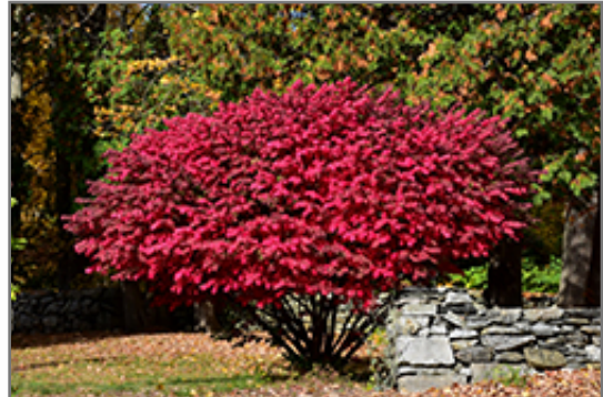
Winged Burning Bush in fall

Winged Burning Bush is recommended for the following landscape applications;