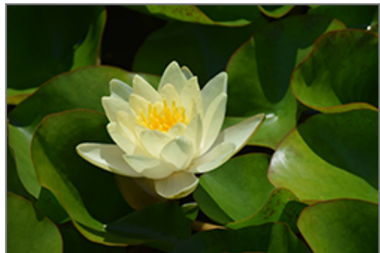
Marliacea Chromatella Hardy Water Lily flowers